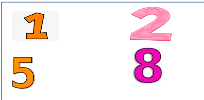
a set of numbers

PRACTICE EXAMPLE: Write the name for each set.